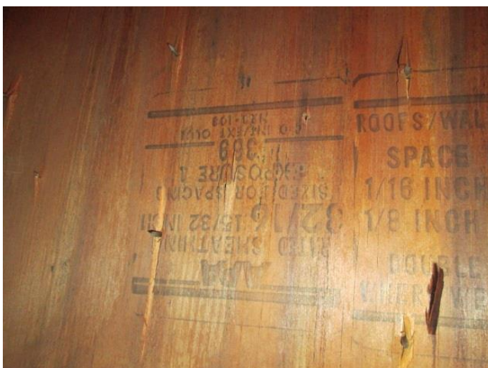
Roof Deck Material