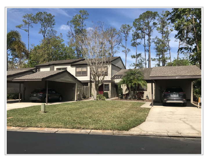
55/65/75/85 Woods Landing Trail 34677