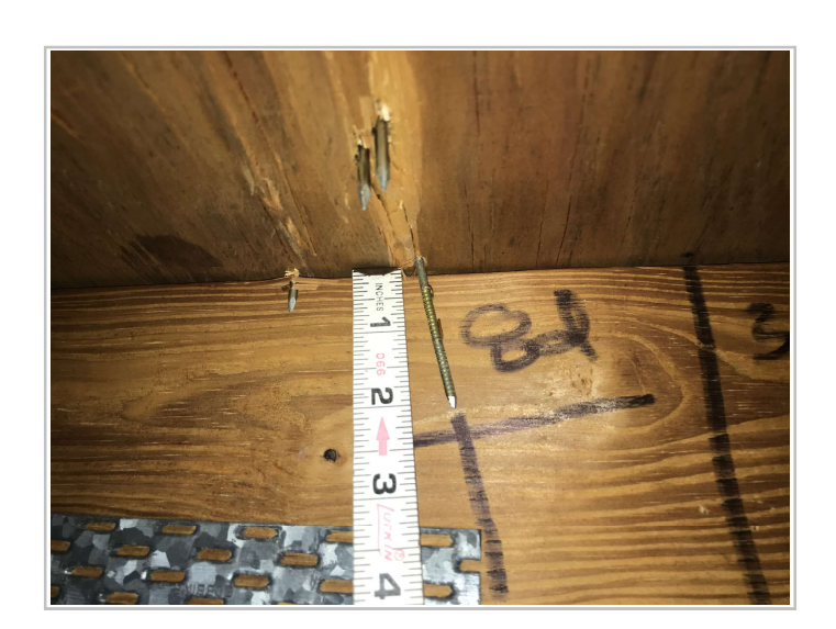
8d Ringshank Renail