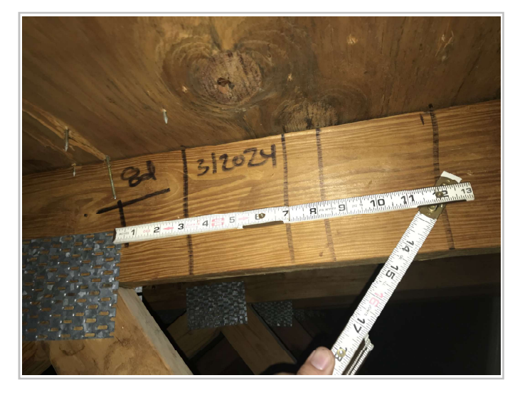
8d Nails within 6"