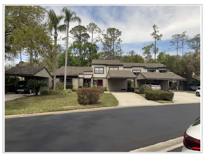
165/175/185/195/205/215/225 Woods Landing Trail 34677