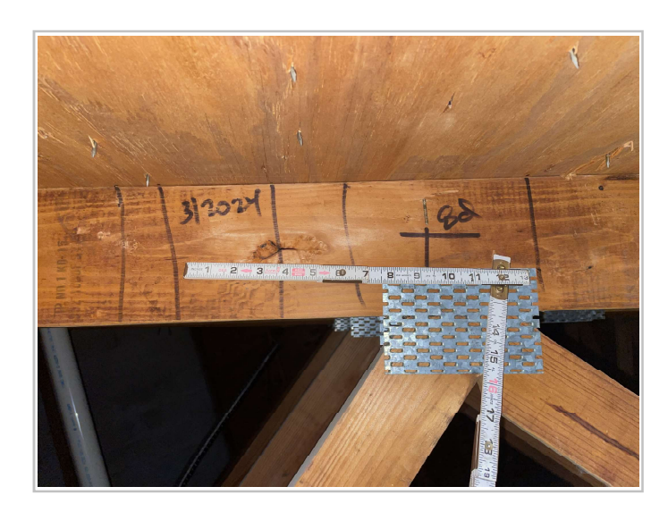
8d Nails within 6"