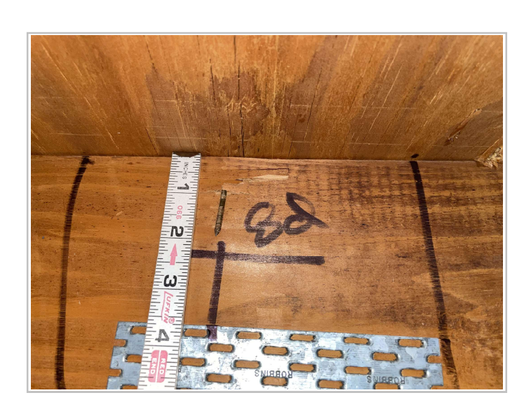
8d Ringshank Renail